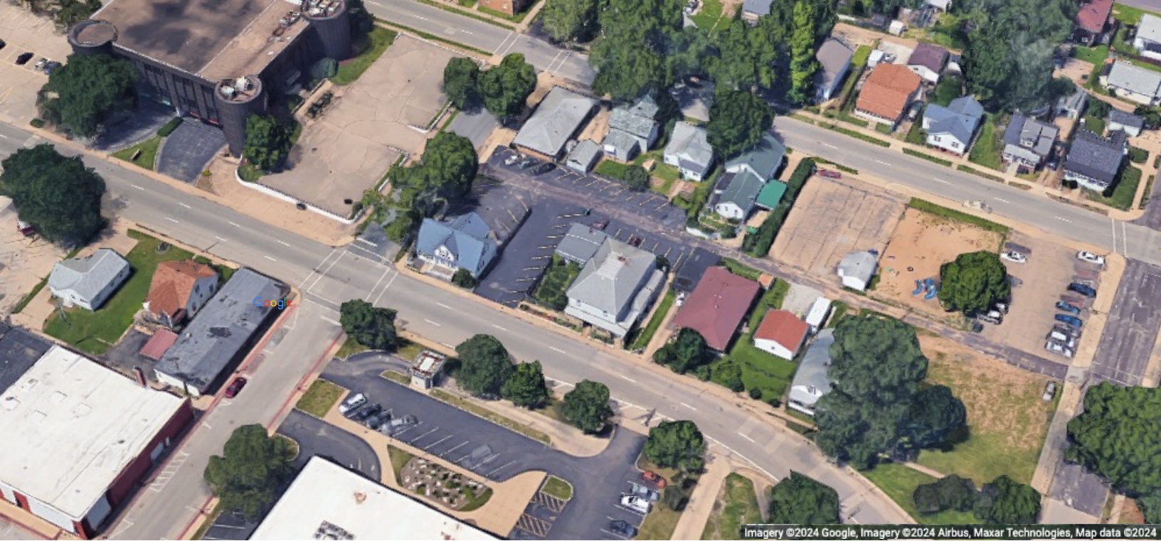
Imagery ©2024 Google, Imagery ©2024 Airbus, Maxar Technologies, Map data ©2024